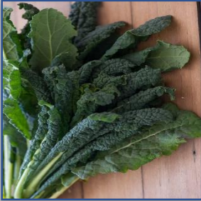
Kale Nero di Toscana Sept-June