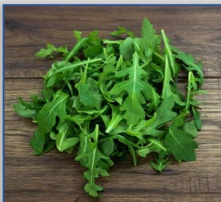
Wild Rocket (Spicy)