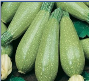
Green Verde d'Italia