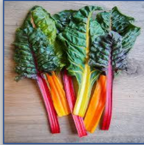
Rainbow Chard Jun - Nov