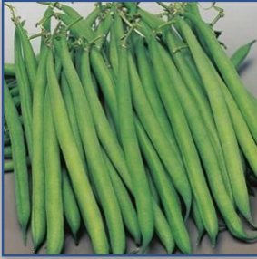
Green Beans Jul -Sep