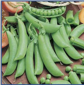
Sugar Snap Peas Jul - Aug