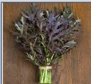
Mustard Ruby Streaks