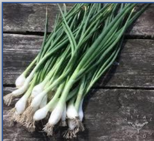
Spring Onion June - Oct