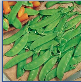
Mangetout Peas Jul - Aug