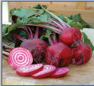
Chioggia Jun - Oct