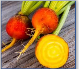
Golden June - Oct