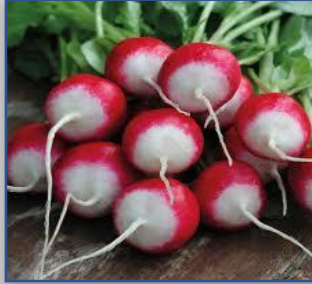
Sparkler Apr - Jun