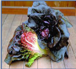
Little Gem Intred