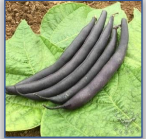
Purple Beans Jul -Sep