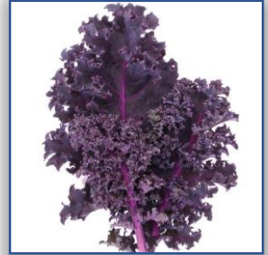
Kale Redbor Sept- March