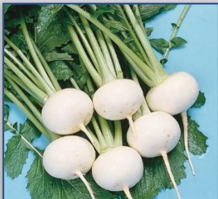
Salad Turnip June - Jul Sep - Nov