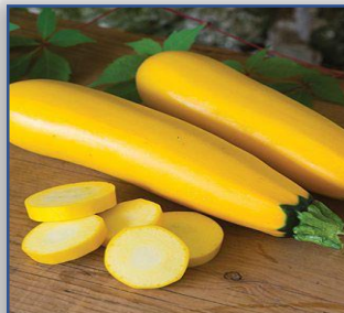
Yellow Burpee Gold