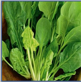
Spinach Medania Apr - Jun, Sep - Dec