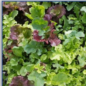
Synergy May - Oct