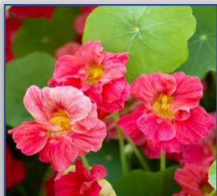
Nasturtium Cherry Rose