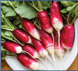
French Breakfast Apr - Jun