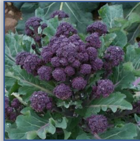
Purple sprouting Feb-May