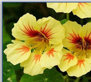
Nasturtium Peach Melba