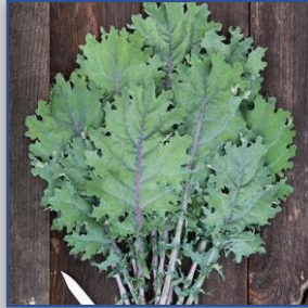
Kale Red Russian Sept-June