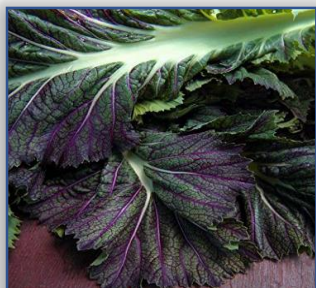
Mustard Dragon's tongue