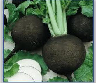
Spanish Black Sep - Feb