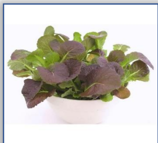
Mustard Osaka Purple