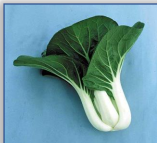
Pak Choi Joy choi & Glacier