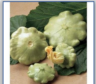
Patty Pan Beginnings Green