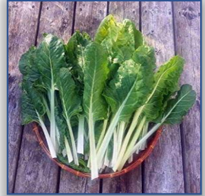
Fordhook Chard Jun - Nov