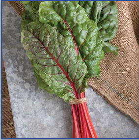
Ruby Chard Jun - Nov