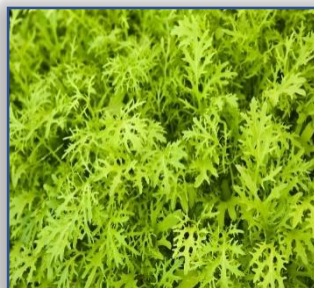
Mustard Golden Frills