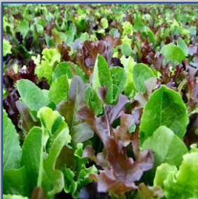
Lettuce Rainbow May - Oct