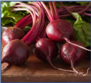
Boltardy Red Jun - Oct