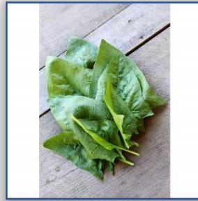
Spinach Palco Apr - Jun