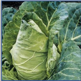
Spring Greens Early Durham Sept-June