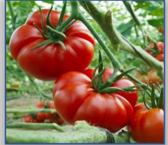
Super Marmande (Beef)