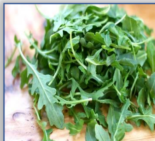
Italian Arugula (Mild)