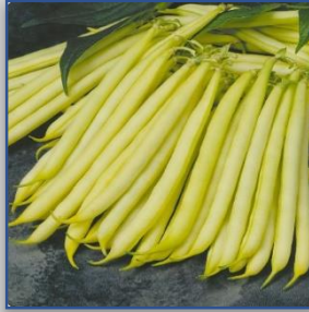
Yellow Beans Jul -Sep